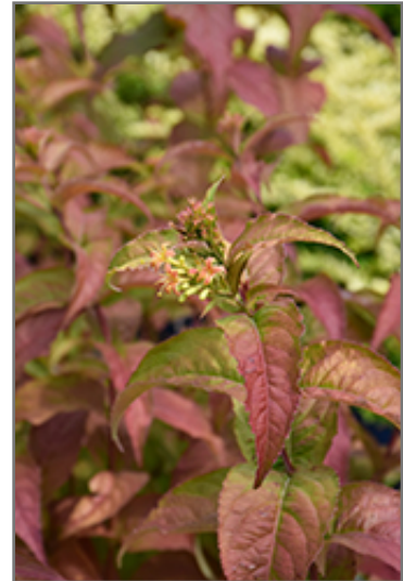
Firefly Diervilla flowers