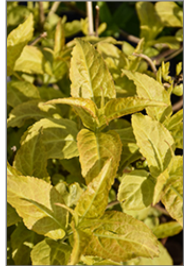
Firefly Diervilla foliage

Firefly Diervilla makes a fine choice for the outdoor landscape, but it is also well-suited for use in outdoor pots and containers. Because of its height, it is often used as a 'thriller' in the 'spiller-thriller-filler' container combination; plant it near the center of the pot, surrounded by smaller plants and those that spill over the edges. It is even sizeable enough that it can be grown alone in a suitable container. Note that when grown in a container, it may not perform exactly as indicated on the tag - this is to be expected. Also note that when growing plants in outdoor containers and baskets, they may require more frequent waterings than they would in the yard or garden.