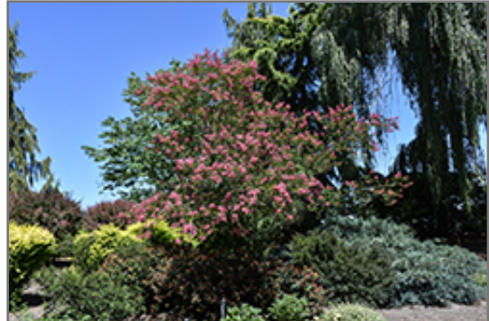
Pecos Crapemyrtle in bloom

Pecos Crapemyrtle is recommended for the following landscape applications;