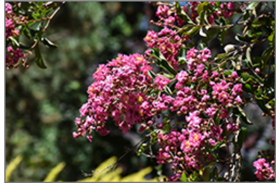
Pecos Crapemyrtle flowers

Pecos Crapemyrtle will grow to be about 12 feet tall at maturity, with a spread of 10 feet. It has a low canopy with a typical clearance of 1 foot from the ground, and is suitable for planting under power lines. It grows at a medium rate, and under ideal conditions can be expected to live for approximately 20 years.