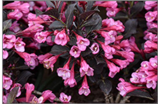
Coco Chill Weigela flowers

Coco Chill Weigela is recommended for the following landscape applications;