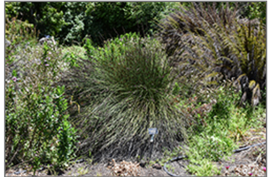
Small Cape Rush