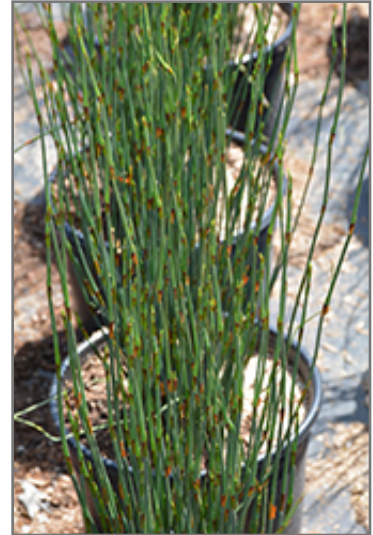
Small Cape Rush foliage

Small Cape Rush is recommended for the following landscape applications;