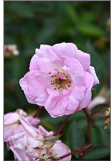
Marie Daly Rose flowers