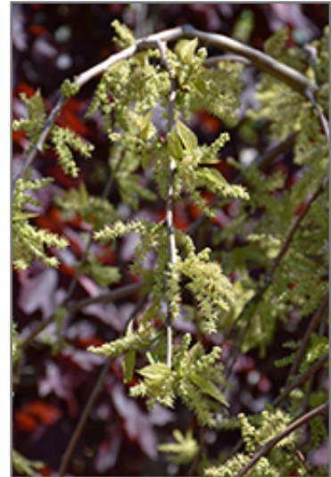
Chaparral Weeping Mulberry flowers