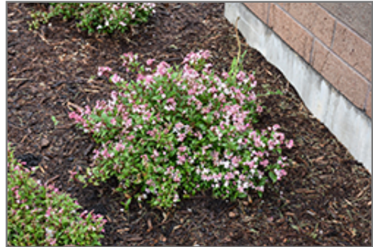
Yuki Kabuki Deutzia in bloom