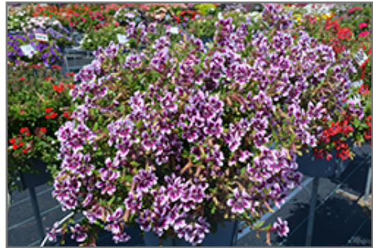
Sweet Talk Lavender Splash Cuphea in bloom