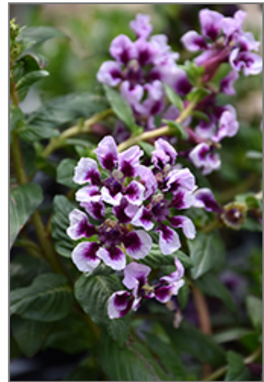
Sweet Talk Lavender Splash Cuphea flowers

This is a relatively low maintenance plant, and is best cleaned up in early spring before it resumes active growth for the season. It is a good choice for attracting butterflies and hummingbirds to your yard. It has no significant negative characteristics.