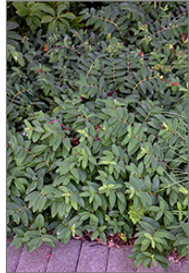
St. John's Wort

St. John's Wort is recommended for the following landscape applications;