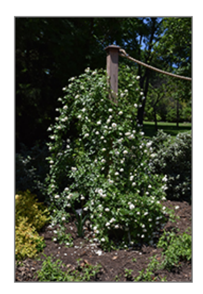
Iceberg Rose in bloom