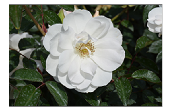
Iceberg Rose flowers

Iceberg Rose is recommended for the following landscape applications;