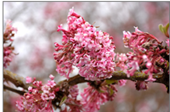
Dawn Viburnum flowers