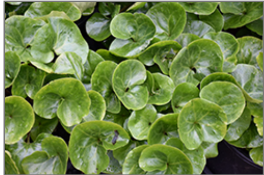
European Wild Ginger foliage