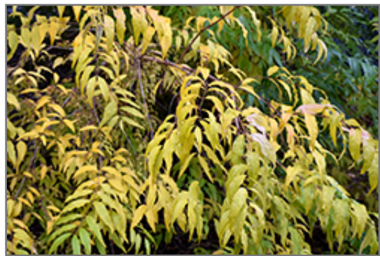
Fortune Fontanesia in fall