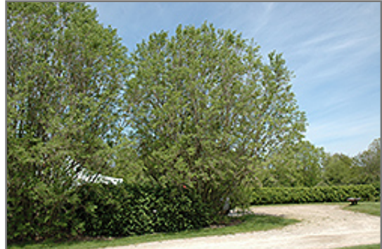
Fortune Fontanesia