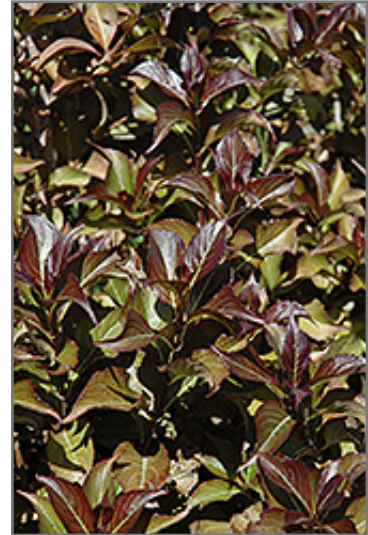
Dark Horse Weigela foliage

Dark Horse Weigela makes a fine choice for the outdoor landscape, but it is also well-suited for use in outdoor pots and containers. Because of its height, it is often used as a 'thriller' in the 'spiller-thriller-filler' container combination; plant it near the center of the pot, surrounded by smaller plants and those that spill over the edges. It is even sizeable enough that it can be grown alone in a suitable container. Note that when grown in a container, it may not perform exactly as indicated on the tag - this is to be expected. Also note that when growing plants in outdoor containers and baskets, they may require more frequent waterings than they would in the yard or garden.