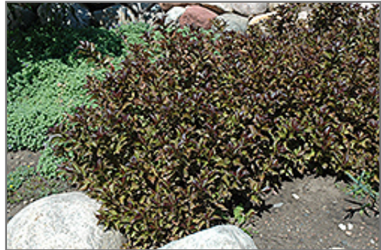
Dark Horse Weigela