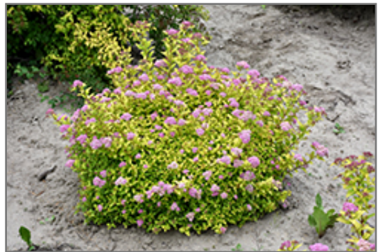
Sundrop Spirea in bloom