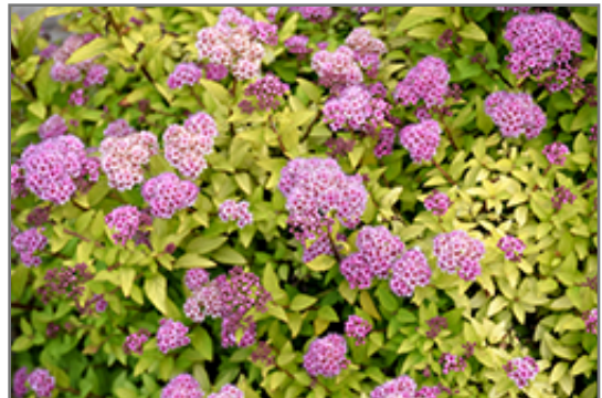
Sundrop Spirea flowers

Sundrop Spirea is recommended for the following landscape applications;