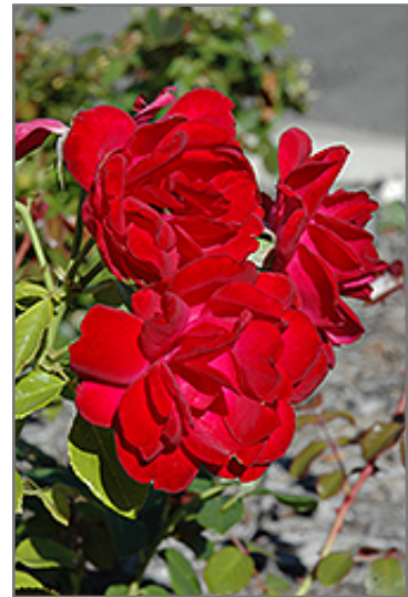
My Girl Rose flowers