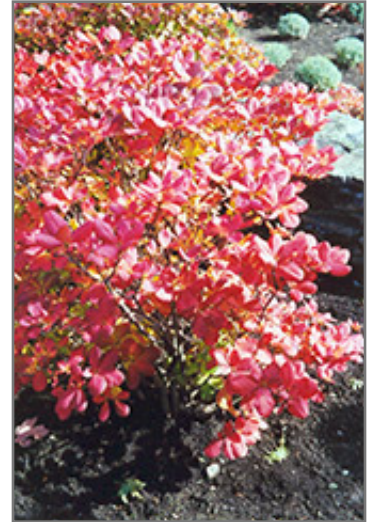
Royal Azalea in fall

This shrub does best in full sun to partial shade. You may want to keep it away from hot, dry locations that receive direct afternoon sun or which get reflected sunlight, such as against the south side of a white wall. It requires an evenly moist well-drained soil for optimal growth, but will die in standing water. It is not particular as to soil pH, but grows best in rich soils. It is somewhat tolerant of urban pollution, and will benefit from being planted in a relatively sheltered location. Consider applying a thick mulch around the root zone in winter to protect it in exposed locations or colder microclimates. This species is not originally from North America.