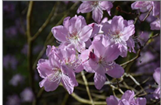
Royal Azalea flowers