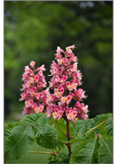
Fort McNair Red Horse Chestnut flowers