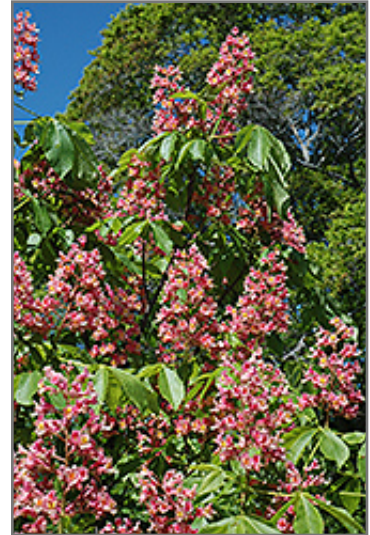
Fort McNair Red Horse Chestnut flowers

This tree does best in full sun to partial shade. It prefers to grow in average to moist conditions, and shouldn't be allowed to dry out. It is not particular as to soil type or pH. It is highly tolerant of urban pollution and will even thrive in inner city environments. This particular variety is an interspecific hybrid.