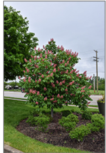
Fort McNair Red Horse Chestnut in bloom