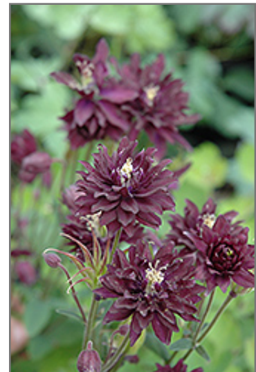
Clementine Dark Purple Columbine flowers