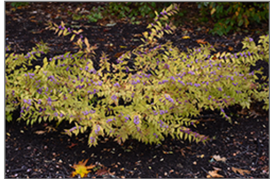
Early Amethyst Beautyberry fruit