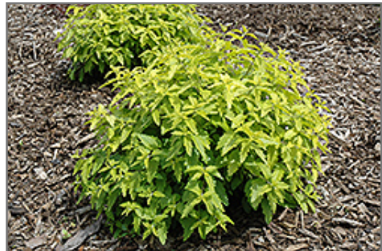
Sunshine Blue Caryopteris