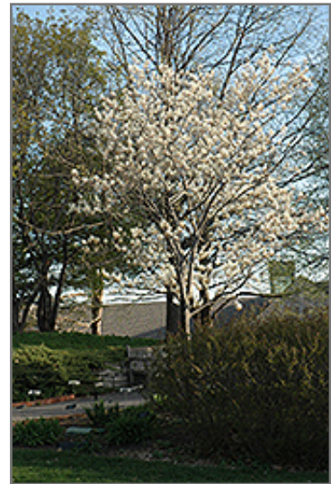
Cumulus Serviceberry in bloom