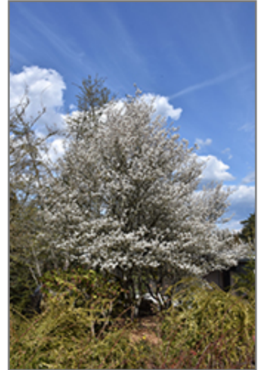
Cumulus Serviceberry in bloom

This shrub does best in full sun to partial shade. It prefers to grow in average to moist conditions, and shouldn't be allowed to dry out. It is not particular as to soil type or pH. It is somewhat tolerant of urban pollution. This is a selection of a native North American species.