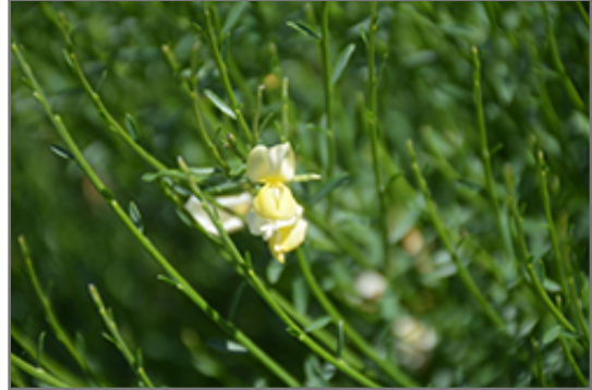
Moonlight Scotch Broom flowers

This shrub should only be grown in full sunlight. It prefers dry to average moisture levels with very well-drained soil, and will often die in standing water. It is considered to be drought-tolerant, and thus makes an ideal choice for xeriscaping or the moisture-conserving landscape. It is particular about its soil conditions, with a strong preference for clay, alkaline soils, and is able to handle environmental salt. It is highly tolerant of urban pollution and will even thrive in inner city environments. This is a selected variety of a species not originally from North America.