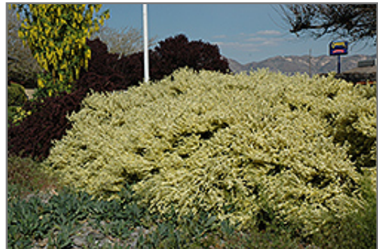
Moonlight Scotch Broom in bloom

Moonlight Scotch Broom is recommended for the following landscape applications;