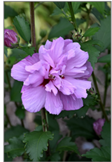
Ardens Rose of Sharon flowers