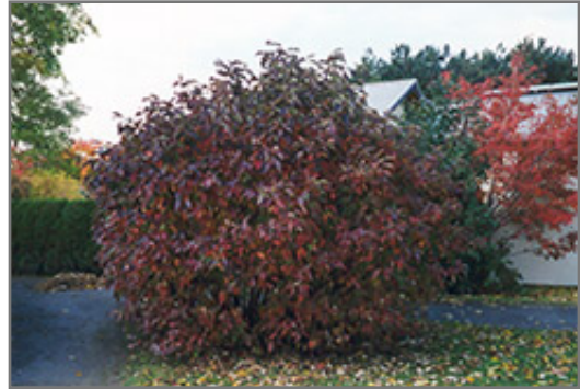
Siberian Dogwood in fall

This shrub does best in full sun to partial shade. It is an amazingly adaptable plant, tolerating both dry conditions and even some standing water. It is not particular as to soil type or pH. It is highly tolerant of urban pollution and will even thrive in inner city environments. This is a selected variety of a species not originally from North America.