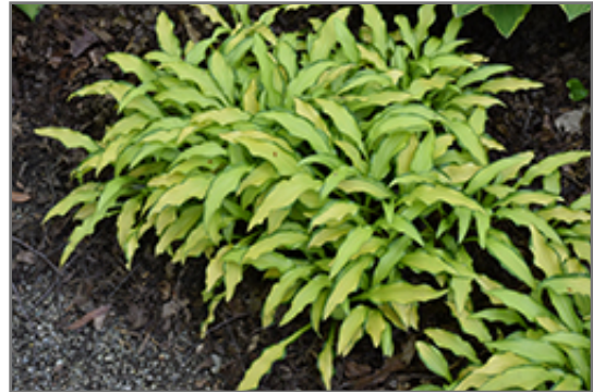
Kabitan Hosta