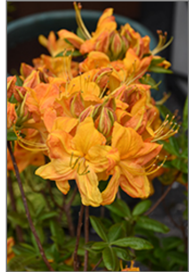
Klondyke Azalea flowers