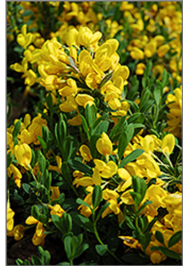
Royal Gold Woadwaxen flowers

This shrub should only be grown in full sunlight. It prefers dry to average moisture levels with very well-drained soil, and will often die in standing water. It is considered to be drought-tolerant, and thus makes an ideal choice for a low-water garden or xeriscape application. It is particular about its soil conditions, with a strong preference for sandy, alkaline soils, and is able to handle environmental salt. It is highly tolerant of urban pollution and will even thrive in inner city environments. This is a selected variety of a species not originally from North America.