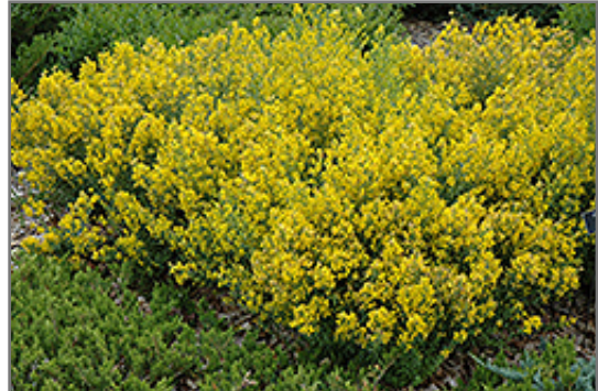
Royal Gold Woadwaxen in bloom