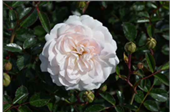
Sea Foam Rose flowers