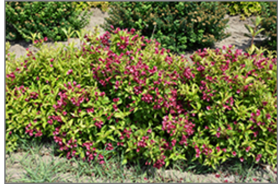
Ghost Weigela in bloom

This shrub should only be grown in full sunlight. It prefers to grow in average to moist conditions, and shouldn't be allowed to dry out. It is not particular as to soil type or pH. It is highly tolerant of urban pollution and will even thrive in inner city environments. This is a selected variety of a species not originally from North America.