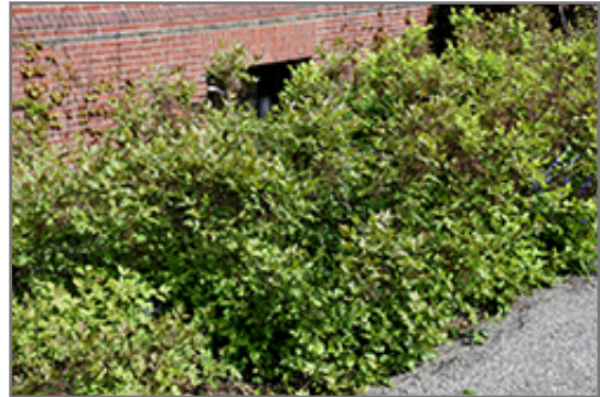
Shrub Yellowroot