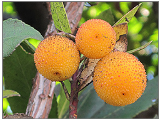
Strawberry Tree fruit