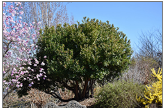
Strawberry Tree