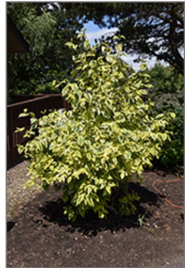
Hedgerows Gold Variegated Red-Twig Dogwood