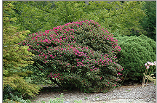
Pocomoke Crapemyrtle in bloom