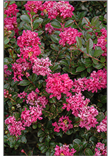
Pocomoke Crapemyrtle flowers

Pocomoke Crapemyrtle is recommended for the following landscape applications;