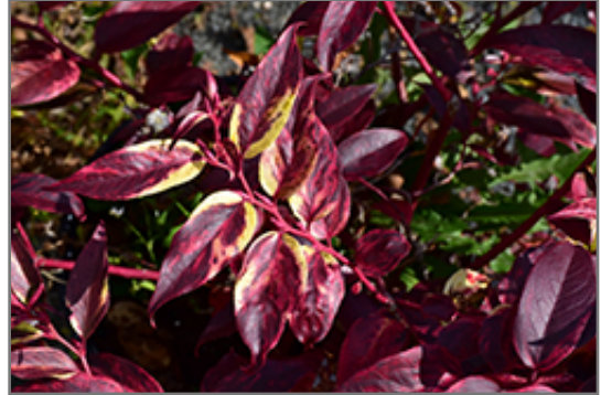
Rainbow Fetterbush in fall

Rainbow Fetterbush makes a fine choice for the outdoor landscape, but it is also well-suited for use in outdoor pots and containers. Because of its height, it is often used as a 'thriller' in the 'spiller-thriller-filler' container combination; plant it near the center of the pot, surrounded by smaller plants and those that spill over the edges. It is even sizeable enough that it can be grown alone in a suitable container. Note that when grown in a container, it may not perform exactly as indicated on the tag - this is to be expected. Also note that when growing plants in outdoor containers and baskets, they may require more frequent waterings than they would in the yard or garden.