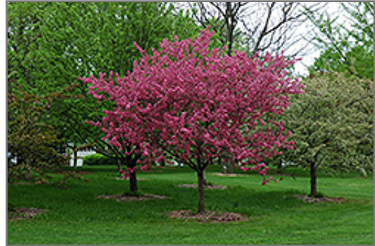
Prairifire Flowering Crab in bloom

Prairifire Flowering Crab is recommended for the following landscape applications;