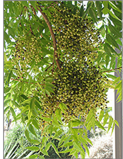
Chinese Pistache fruit

This tree should only be grown in full sunlight. It is very adaptable to both dry and moist growing conditions, but will not tolerate any standing water. It is not particular as to soil type or pH. It is highly tolerant of urban pollution and will even thrive in inner city environments. This species is not originally from North America.