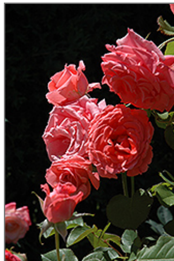
Climbing America Rose flowers